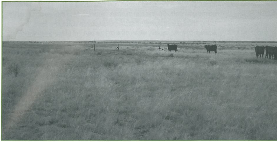
As is evidenced in this picture from October 2011, Gary has been able to keep standing forage to better protect the soil from heat and wind as well as trap snow in the winter.

grazed by a large herd. This acts as mulch and further increases water retention and slows down evaporation, and the water cycle is improved.